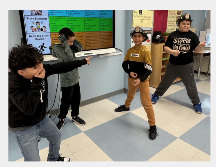
5th Grade Improv of Firefighters putting out a fire.