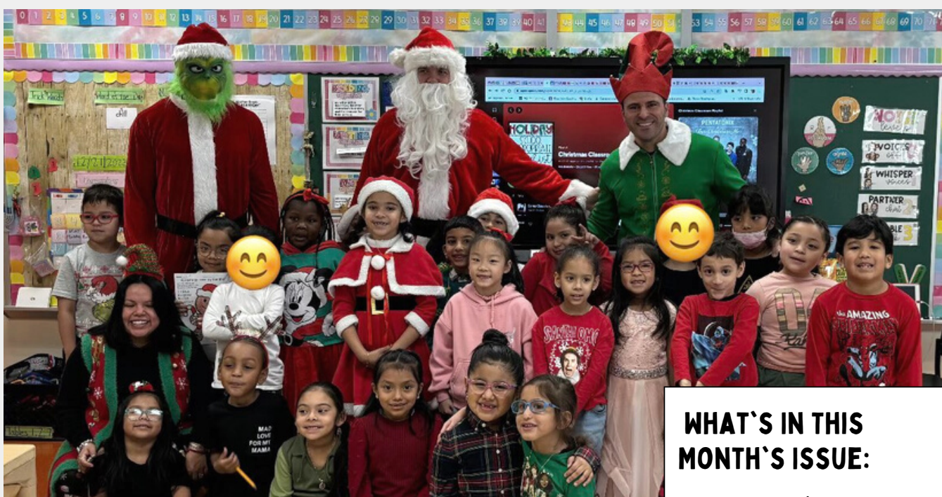
Thank you to our AMAZING PTA! 2023 ended with some special visitors and gifts for all of our kids!