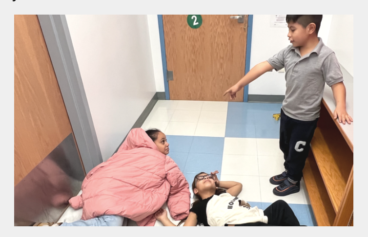
3rd Grade Improv of kids not going to sleep at a sleepover.