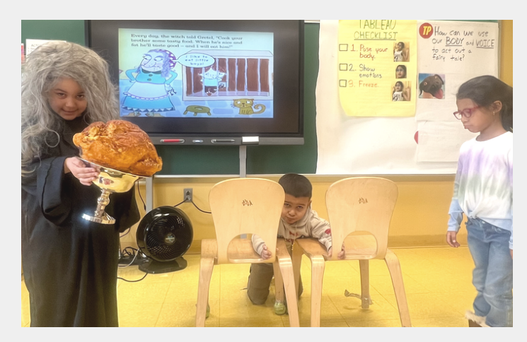
Kindergarten acting out Hansel and Gretel.

In December, our 3rd, 4th, and 5th graders immersed themselves in the captivating world of Improv, a collaborative journey to craft narratives on the fly. We used a set of Improv tips to help us. Some tips are: choose a setting; choose characters that make sense to be in that setting; always have a problem; If a problem goes on too long solve it and move on to another one; Use at least one solution; All teammates should help to keep the story going; and don't have bad guys chase you, talk it out with dialogue instead. Through the use of a rubric, classmates were able to evaluate and score each other's improv performances, fostering a supportive environment for growth and improvement.